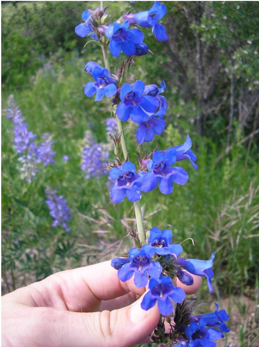
Close up of Penstemon mensarum by Bernadette Kuhn