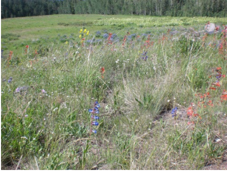
Habitat of Penstemon mensarum