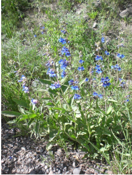
Close up of Penstemon mensarum by Peggy Lyon.